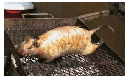
Grass cutter on the Grill @ $10.00-$15.00/pound